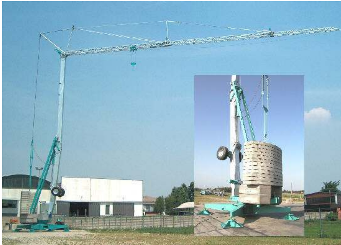
Curve di carico/Load diagrams/Courbes de charge/Lastkurven/Curvas de cargas